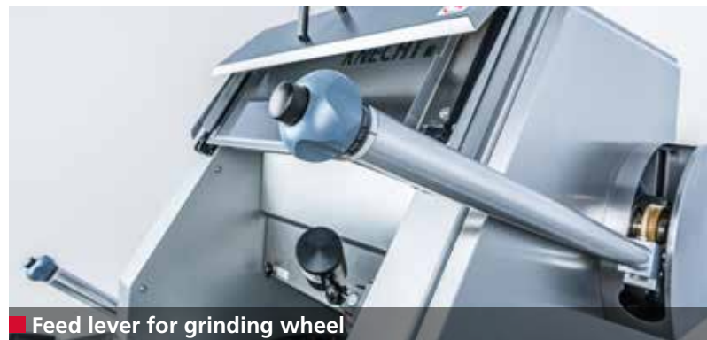
■ Feed lever for grinding wheel

The W 300 ensures exact plane-parallel grindings, high surface quality and a high grinding capacity. These are the best conditions for a premium quality processing of the raw material meat. The aim is to maintain the cutting performance of the cutting tools throughout their whole working life.