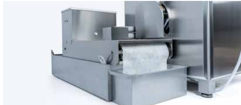
■ Belt filter coolant unit

The W 300 coolant circuit ensures continuous cooling of the workpieces. They are reliably prevented from overheating.