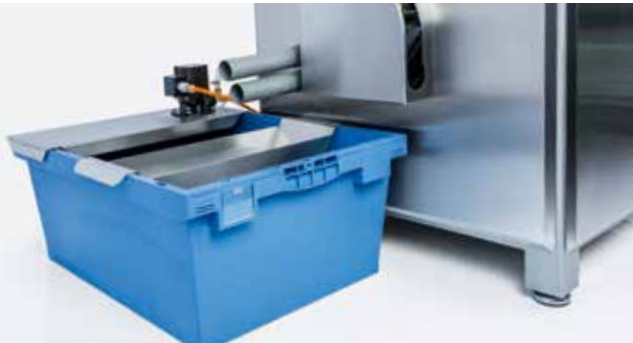
■ Standard coolant unit

Encapsulated workroom and continuous cooling of the workpieces