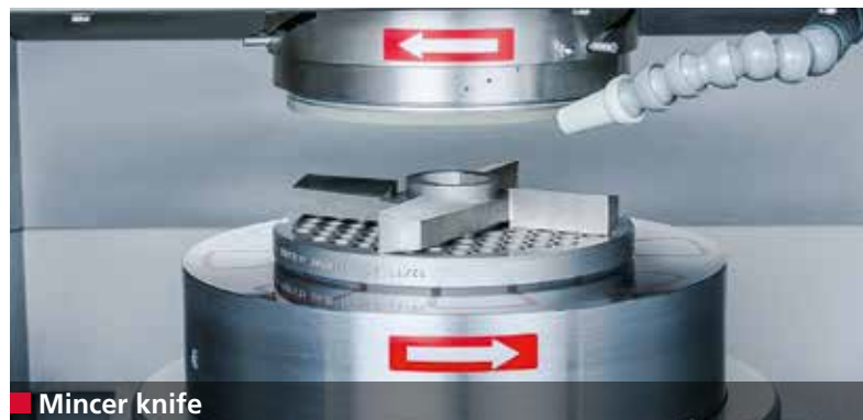
■ Mincer knife

Sharpness and surface flatness of mincer, emulsifier and inline grinder cutting tools have a great impact on the quality of the produced sausage products.