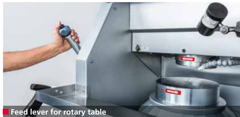
■ Feed lever for rotary table

High grinding performance thanks to strong drive system